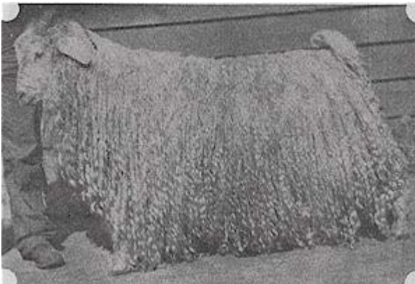
1904 show winner with 20 inches of hair.

National History: At the 1904 St. Louis World’s Fair, there were more Angoras than all other goat breeds combined.